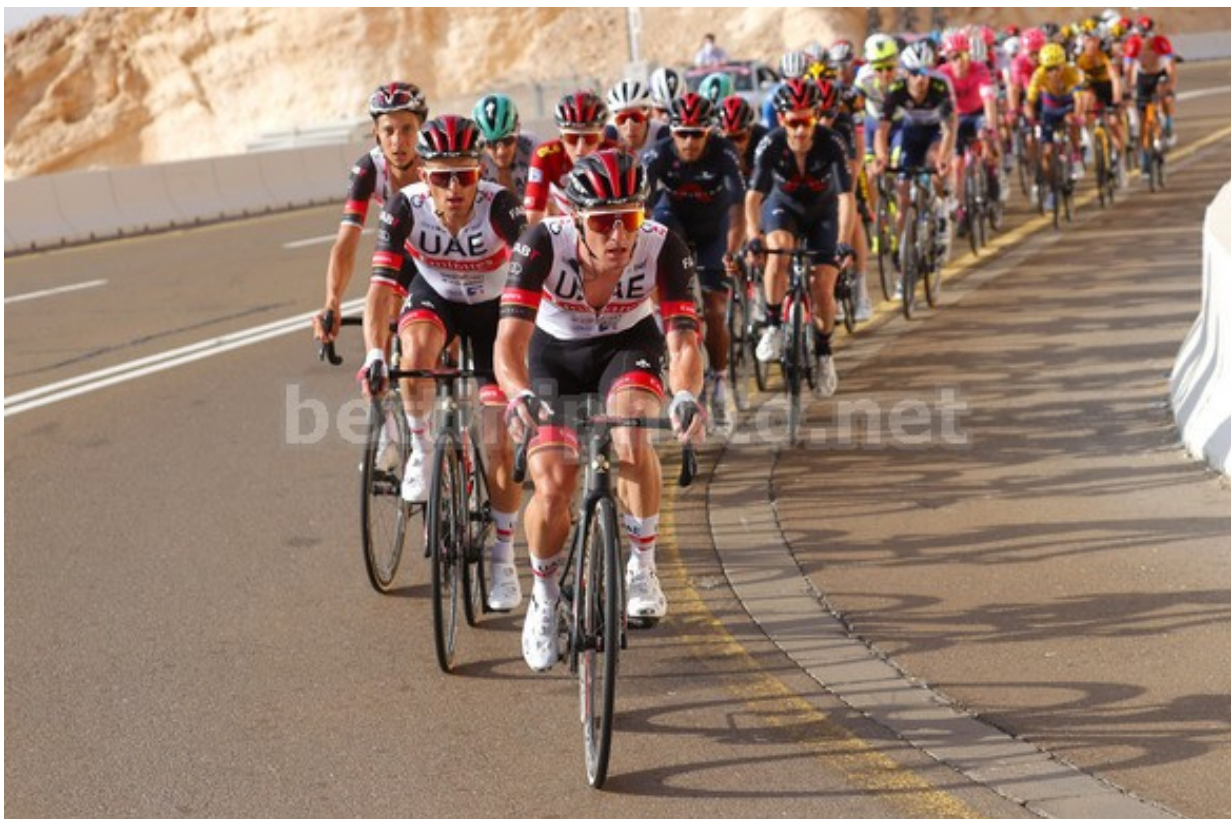
UAE Tour 2021 – 3rd Edition – 3rd stage Strata Manufacturing – Jebel Hafeet 166 km – 23/02/2021 –

“The UAE Tour showcases the UAE’s natural beauty, iconic skyline and world famous developments, and we are honoured that some of our key communities including Palm Jumeirah and Jumeirah Islands will once again be part of this sporting spectacular. We wish the organisers and competitors all the very best for what we are sure will be another great success.”