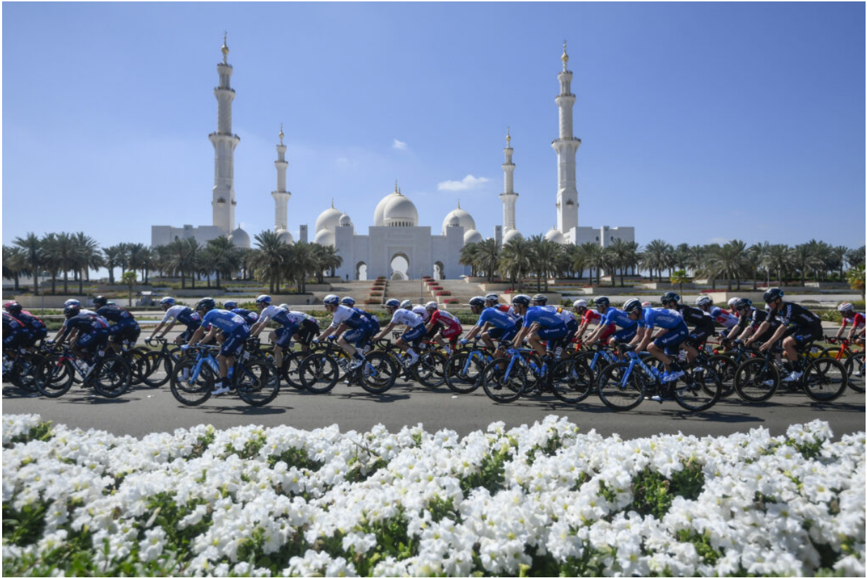
27 Febbraio 2021 Abu Dhabi (Emirati Arabi Uniti)

Final stretch on a wide, slightly curved road. Arrival on tarmac.