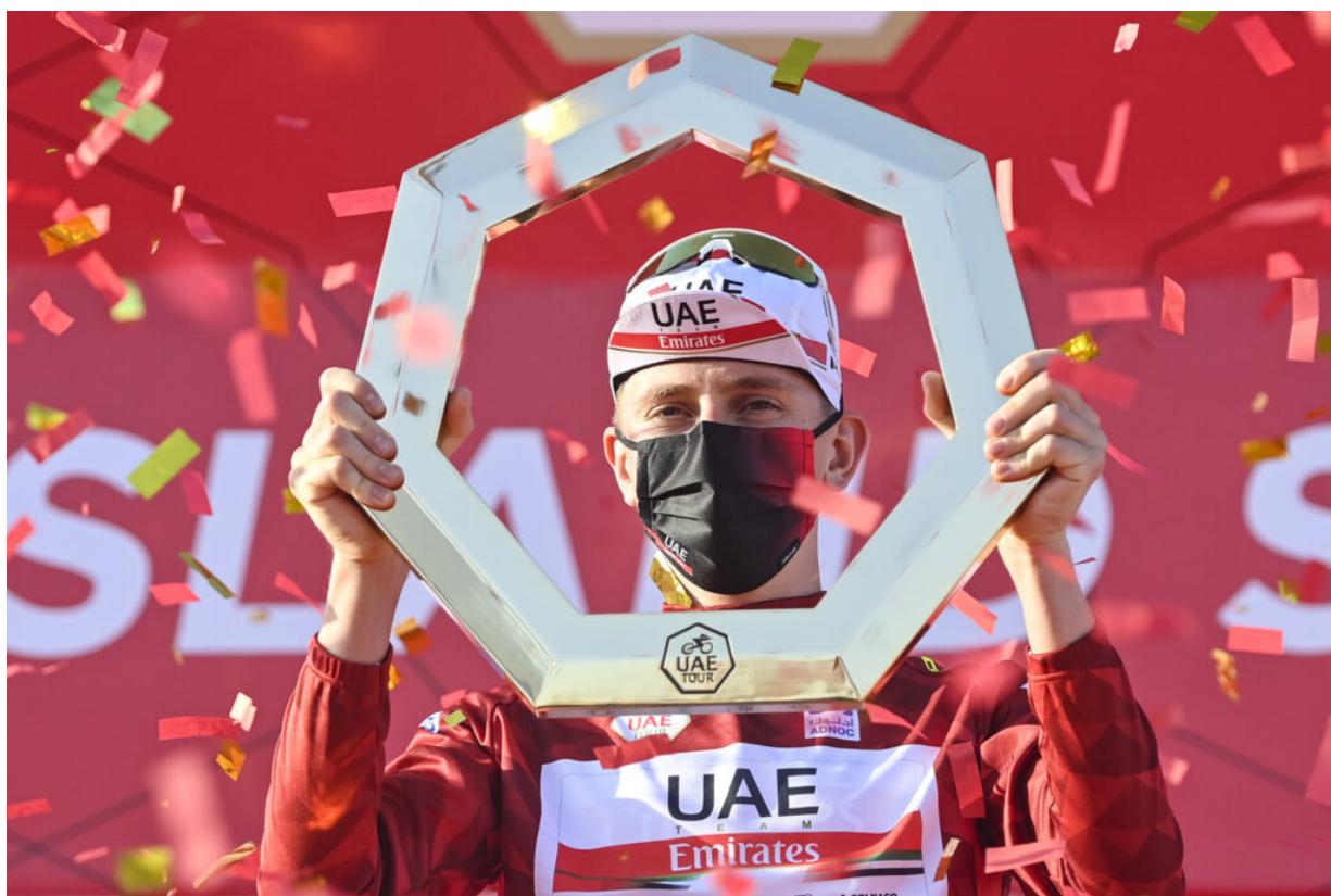
27 Febbraio 2021 Abu Dhabi (Emirati Arabi Uniti)

Stage sponsor and National Partner Mubadala. Official stage partners Dubai Silicon Oasis, Ras Al Khaimah Tourism Development Authority and Official Partners G42, Daman and Tadweer and official suppliers Al Ain Water, Shimano, Colnago and Segafredo.